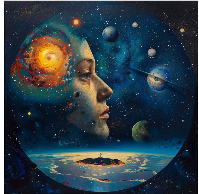
Prompt: Humans become one with the universe