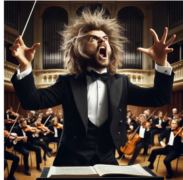
Prompt: Conductor looking like the young Franz Liszt conducting his orchestra