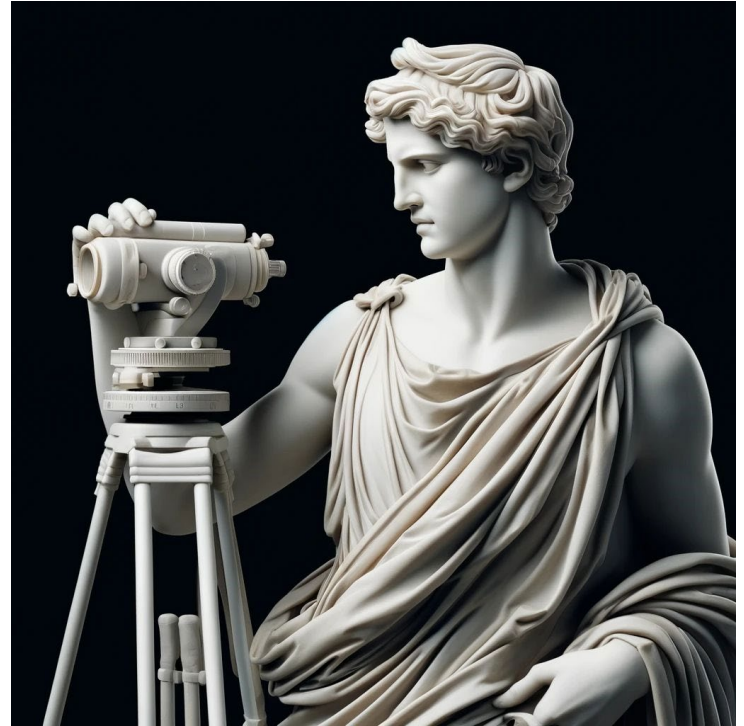
Prompt: land surveyor, helenistic sculpture