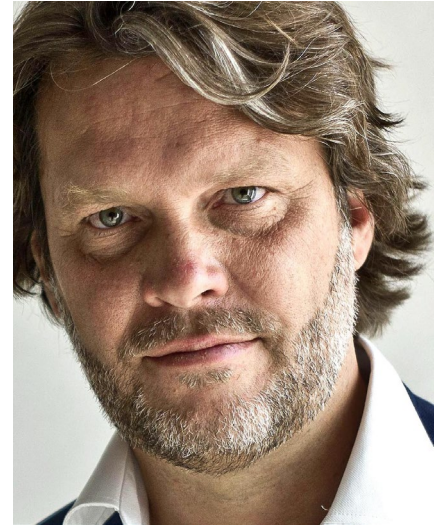
Prompt: Make a LinkedIn foto