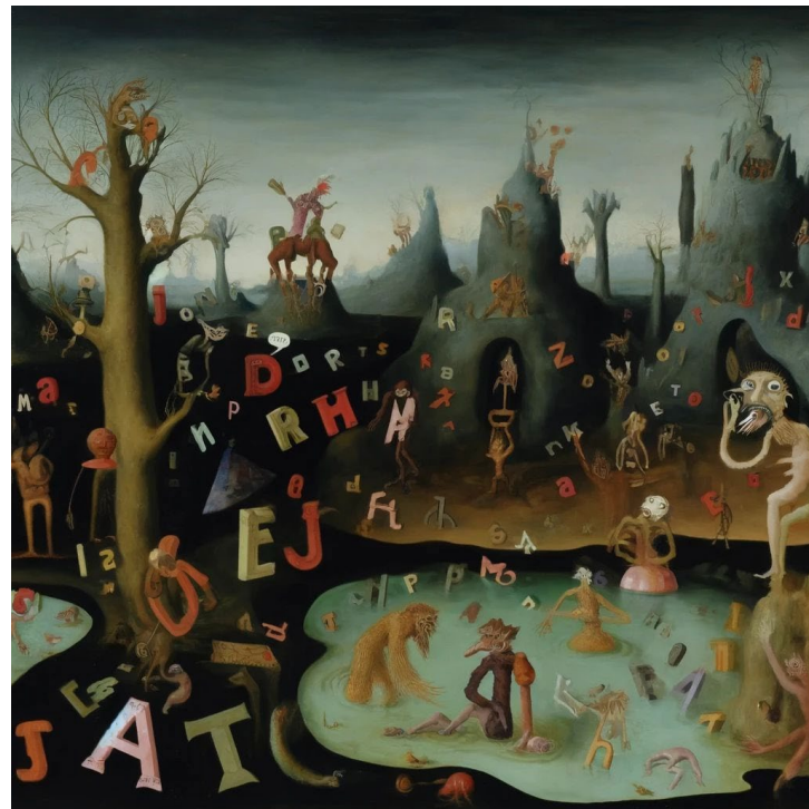
Prompt: cacophony of words, Hieronymus Bosch style