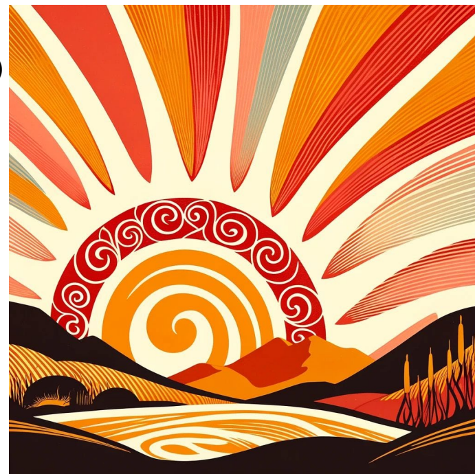
Prompt: Sunrise Maori style